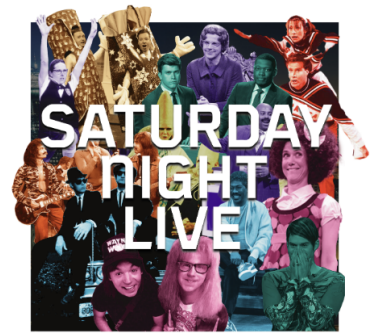
Annual Trivia Night & Auction | Saturday April 5, 2025

Live from Overland Park, it's Saturday Night! Ready to bring the laughs and test your trivia skills? Register now for our Trivia Night and Auction! Whether you gather your own cast of characters and register as a team or sign up solo and join forces with fellow fans, this is your chance to shine under the spotlight. Assemble your Spartan Cheerleaders, Coneheads, or Weekend Update anchors and compete for the ultimate bragging rights—all while supporting our school. Don't wait—spaces are limited, and you won't want to miss this night of comedy, camaraderie, and fundraising!